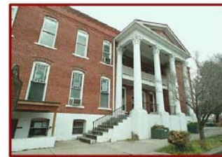
Gilmer County Court House