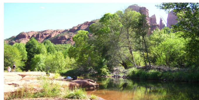
Sedona, Arizona