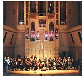
Atlanta Pops Orchestra celebrates their sixtieth year in 2005