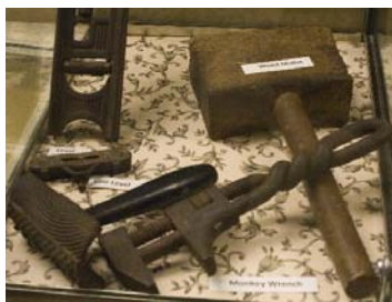
A small sampling of tools on display in the exhibit.

If you haven't stopped by to view what's new at GAHA, be sure and stop by to see our latest exhibit in the Heritage