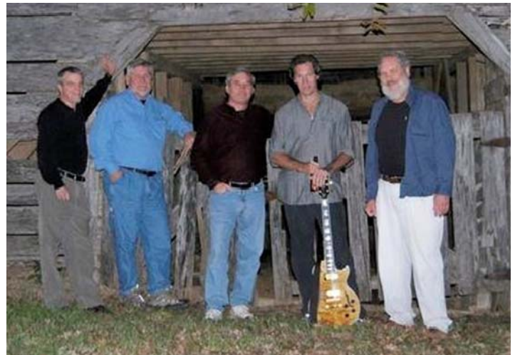
"A Long Way Back" band will perform August 22 at the ETC Pavilion for the upcoming Picnic by the River event.

Gates open at 5:30 pm. Tables will be judged at 7:00 pm with a prize awarded for all around favorite table. Following any announcements, the band will begin performing and continue until around 10:00 pm.