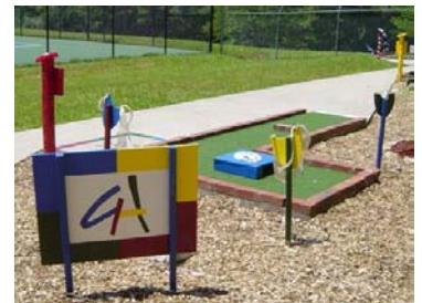
Coosawattee River Resort GAHA 16th Hole