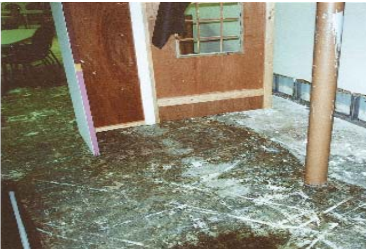
The "Hawthorne Room" at Gilmer Arts and Heritage after damaged flooring and insulation were removed.

When it rains, it pours into the strangest places, as GAHA found out when the same deluge that flooded the Food Lion parking lot in late July also did considerable damage to the GAHA building.