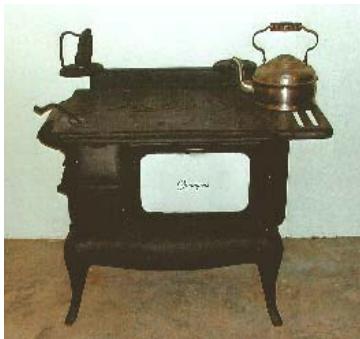
Authentic wood cook stove to be featured in upcoming exhibit.

The Heritage Museum joins the GAHA Gallery in offering a food heritage com-