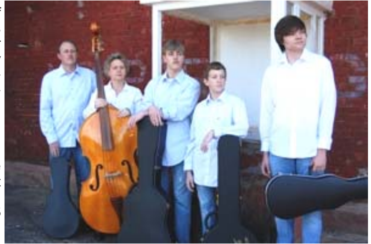
The Barker Brothers deliver pure bluegrass from the east Tennessee Mountains.

The Farm at Crawford's Crossing is off Highway 52