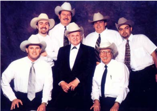
Ralph Stanley & The Clinch Mountain Boys

On Saturday, December 8 at 7:30 pm, the 2007/2008 B.E.S.T. Concert Series premieres at Ellijay Elementary Auditorium with internationally known banjo picker and tenor singer, Dr. Ralph Stanley & The Clinch Mountain Boys.